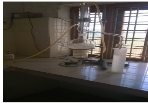
Figure 17: Distilled water