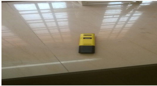
Figure 14: P H meter