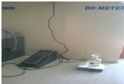
Figure 15: DO meter