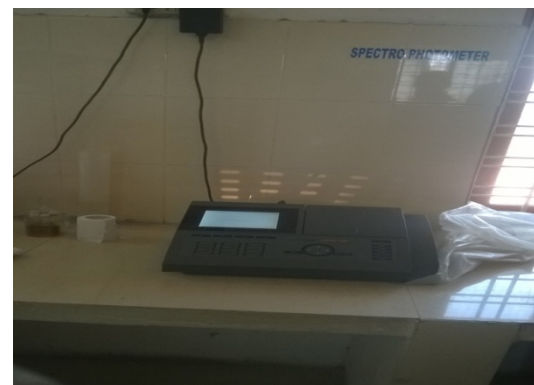
Figure16: Spectro Photometer

Contents: H 2 SO 4 , HgSO 4 , K 2 Cr 2 O 7 and H 2 O